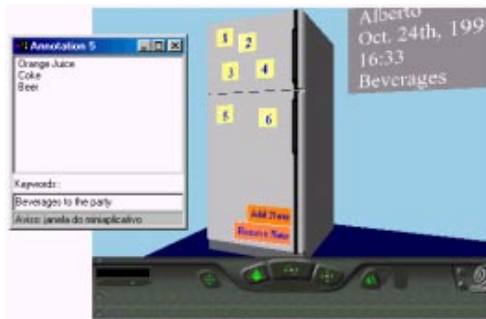
Figure 2: VR-based annotations.

We implemented an illustrative prototype of an annotation-place located on a refrigerator door. Such place enables addition, removal and edition of annotations that are located all over the door. When moving the mouse over an annotation, its author name, date and keywords are displayed. A click on annotation displays its content in an editable dialog (Fig. 2).